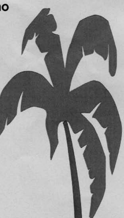
Bring this coupon and get a FREE Bingo Game for the 2<sup>nd</sup> half of Bingo