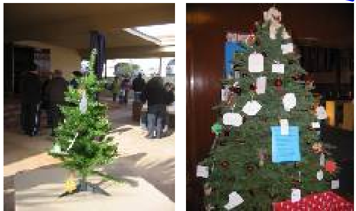
Sharing at Christmas

There is a period of preparation for the celebration of this Sacrament. Parents are required to attend a Pre-Baptismal class. Please contact the rectory in advance.