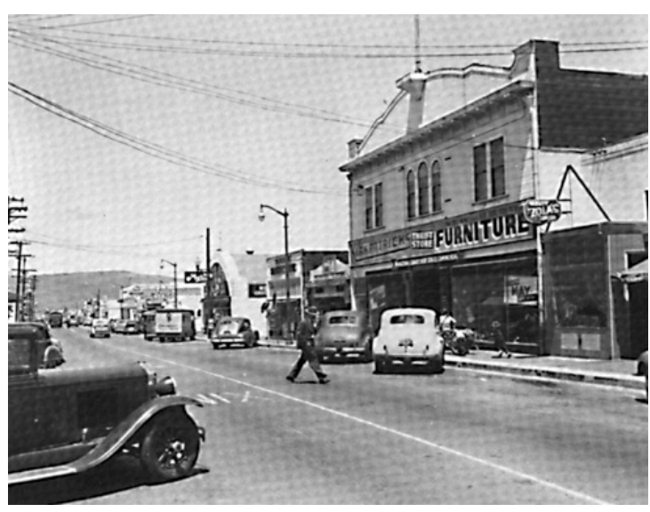
Downtown San Bruno in the 1950's. This photo shows the 400 block of San Mateo Avenue.